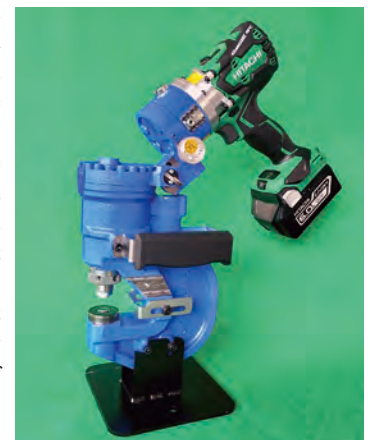
PIAS Nut Hand Tool