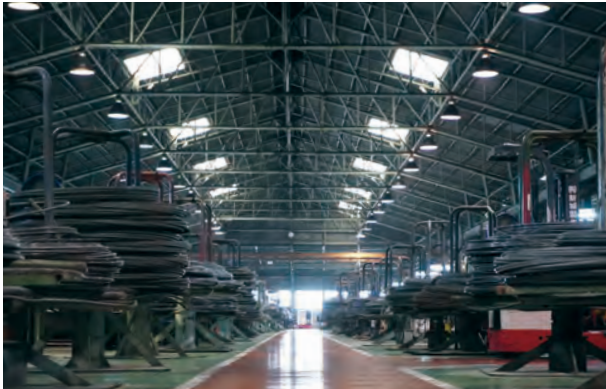
Forging machines that make five million nuts per day