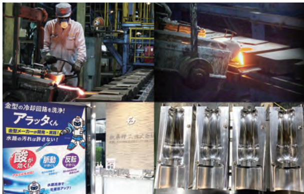
Domestic leading market share by manufacturing and sale of dies for glass bottles.