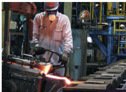
Manufacture from material for dies of glass bottles